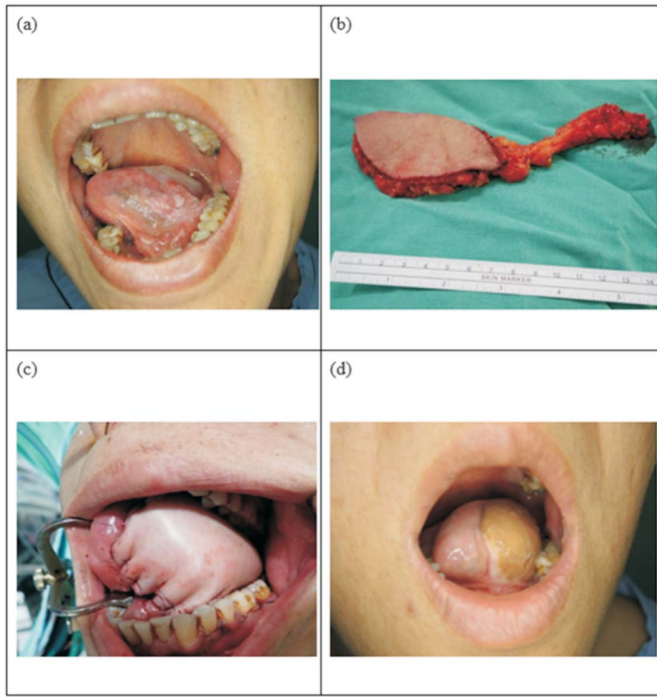
Figure 2. (a) A left tongue squamous cell carcinoma, T2N0M0. (b) Harvesting a long pedicle SCIP flap, pedicle length approximately 8 cm. (c) Left tongue defect was reconstructed with a SCIP flap, pedicle artery end-to-end anastomosis to the superficial thyroid artery. (d) No excessive bulkiness was noted at 1 year postoperatively.

As the general population ages, microsurgical reconstruction is increasingly needed in elderly patients, a group with accompanying comorbidities. A multicentric prospective study has demonstrated that reconstructive microsurgery in the elderly is generally safe and that the American Society of Anesthesiologists (ASA) score is useful for risk stratification. <sup>11</sup> However, there is lack of consensus on the overall safety or potential age limits for older patients undergoing a